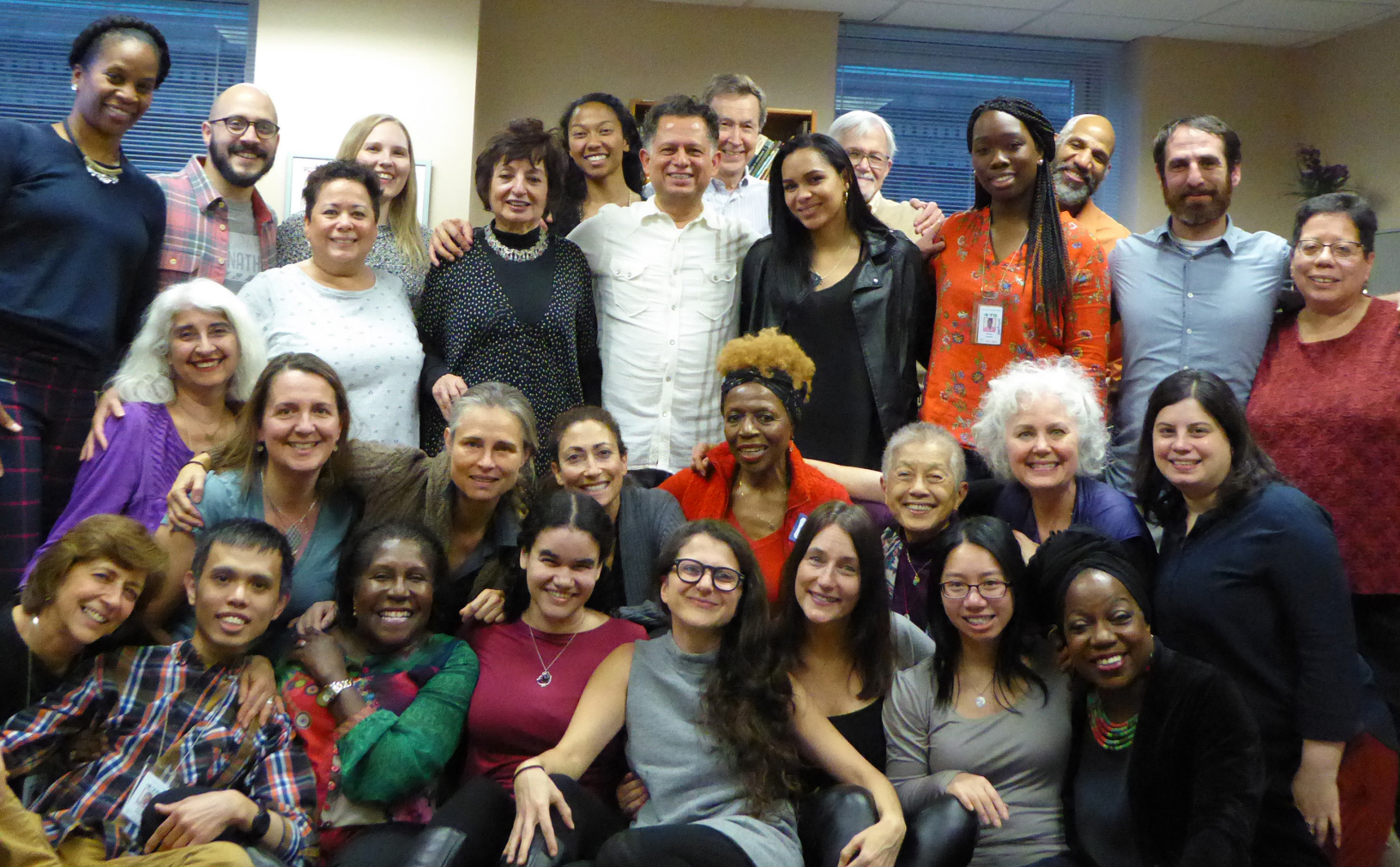
Some of Morningside Center's staff.

Morningside Center for Teaching Social Responsibility 475 Riverside Drive, Suite 550 New York, NY 10115